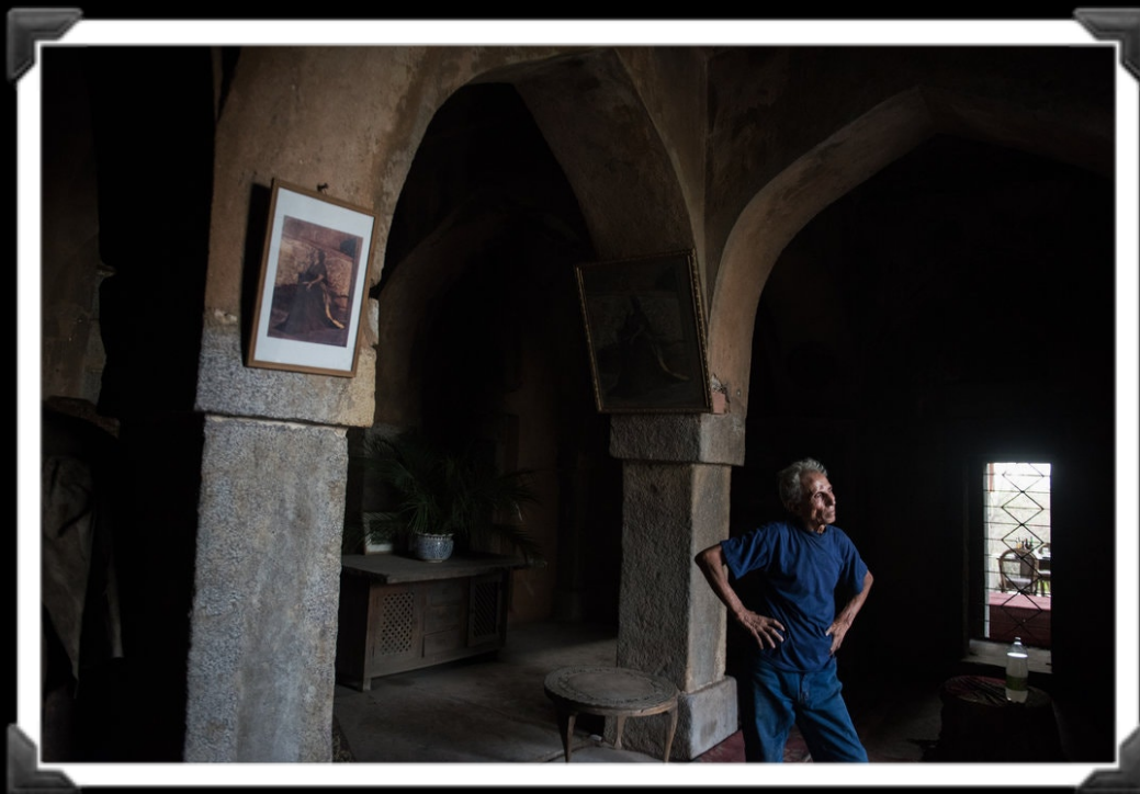
Prince Cyrus of Oudh at his family home in New Delhi in 2016

https://www.nytimes.com/2019/11/22/world/asia/the-jungle-prince-of-delhi.html